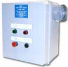
The UniPro™ Control Panel

The actuator is constructed of aircraft-quality aluminum and high-grade carbon and stainless steels for maximum service life. The housing is sealed to prevent intrusion from dirt and water in outdoor applications, while a two-step polyurethane coating provides corrosion protection.