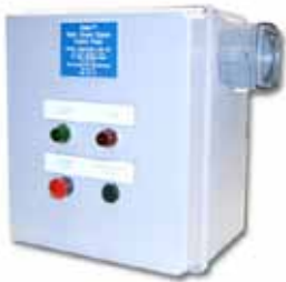
The UniPro™ Control Panel

The actuator is constructed of aircraft-quality aluminum and high-grade carbon and stainless steels for maximum service life. The housing is sealed to prevent intrusion from dirt and water in outdoor applications, while a two-step polyurethane coating provides corrosion protection.