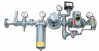
Air Control Unit

The air control unit supplies the proper amount of clean pressurized air to the system. Available in two sizes to operate up to nine UniPro™ LT actuators simultaneously.