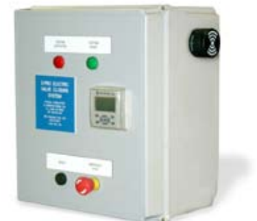
The E-Pro® Control Panel