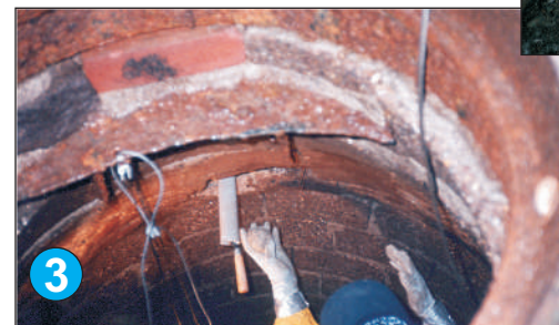
3. The breach is cleaned of loose mortar and WP is applied to instantly stop the leak, forming a watertight plug...