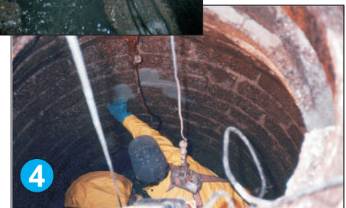
4. The job is completed by sealing in and around the point of entry.